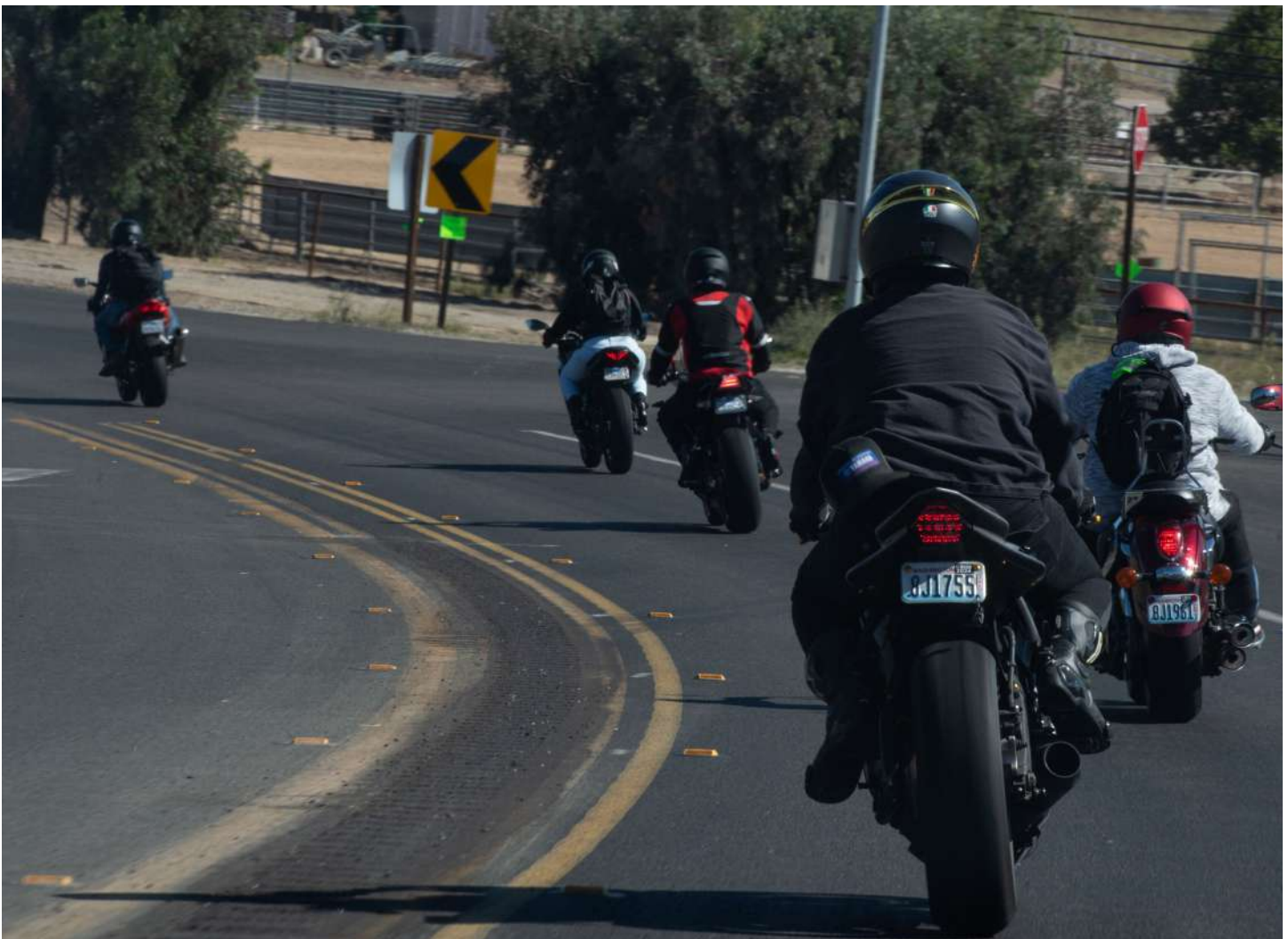
Sailors stationed aboard USS Theodore Roosevelt (CVN 71), ride across San Diego on the Command Safety Motorcycle Ride to promote safety and morale for command riders, Oct. 20, 2023.

Additional Rider Down reports are available here: https://navalsafetycommand.navy.mil/Resources/Motorcycle-Rider-Down-Reports-newsletters/ .